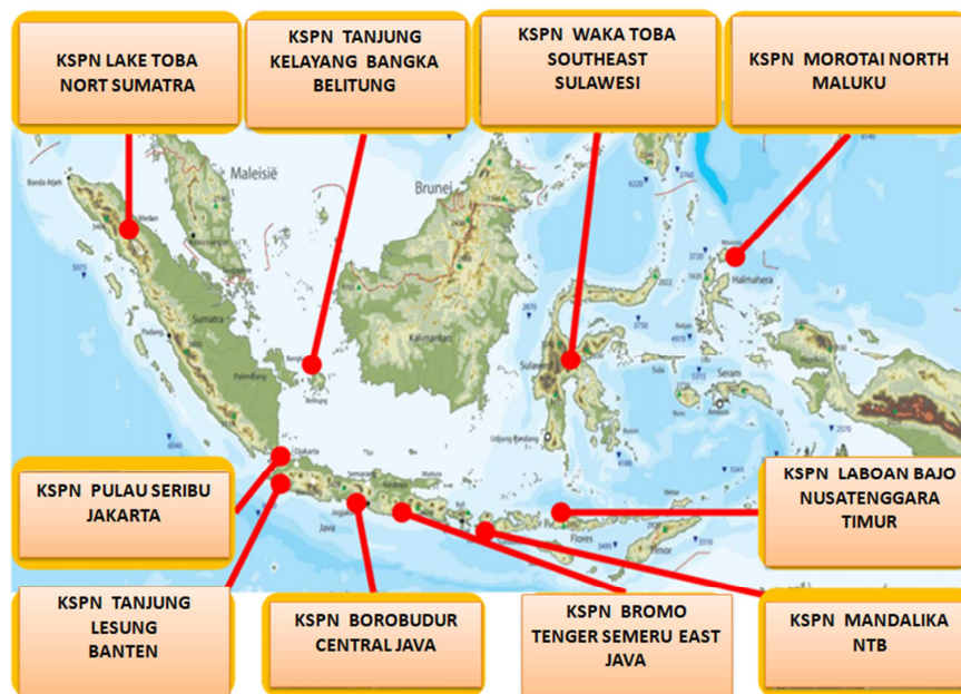
Figure 2. Locations of 10 Priority Tourism Destinations.

Tengger, Semeru (East Java), Mandalika (NTB), Labuan Bajo Komodo (NTT), Wakatobi (Southeast Sulawesi), and Morotai (North Maluku) which are called the "10 New Balis" as specific geographical areas and are equipped with the availability of tourist attractions, public facilities, tourism facilities, accessibility, and interrelated communities, which can be seen from the image below [22, 23].